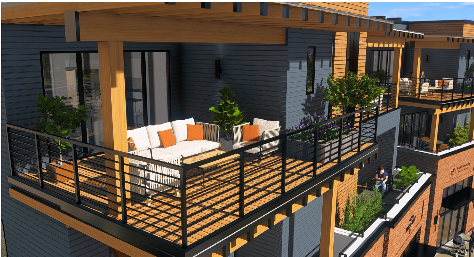
A rendering of the new short-term vacation rentals, Aerie at Discovery Corner, by AvantStay

We know that one of the things people love most about living in Central Oregon, and Discovery West, is being close to outdoor recreation. Also coming up with the development of Phase 5 is an expansion of Discovery Park, and its connected trail system, through the center of the community. This will get you closer to the trails at the Phil's Trail Complex and Shevlin Park—it's really exciting!