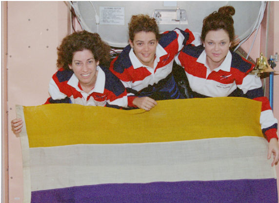
From left: Crewmates Ellen Ochoa, Julie Payette and Tamara Jernigan pose with an original suffrage flag used by the National Women's Party at the International Space Station, 1999.

She is currently writing a series of bilingual children’s board books in English and Spanish, called Dr. Ochoa’s Stellar World . There will be one for each of the letters of STEAM: science, technology, engineering, arts and math. The science book, We Are All Scientists / Todos somos científicos , is already available for you to share with your friends and family. In fact, we have an autographed copy at the Discovery Pod! Dr. Ochoa explains that the book “talks about curiosity being the key to asking questions and also what motivates people to become scientists.”